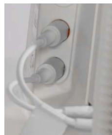
Mattress connection at rear (Disconnect for surgery)