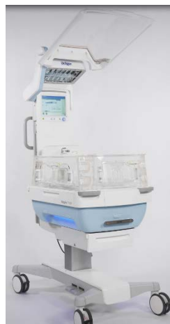
Radiant warmer mode (open hood)