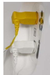
Temperature probe connections at rear (yellow for central monitoring required for servo- control)