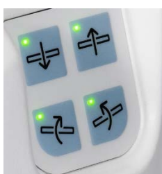
Mattress elevation and tilt keys